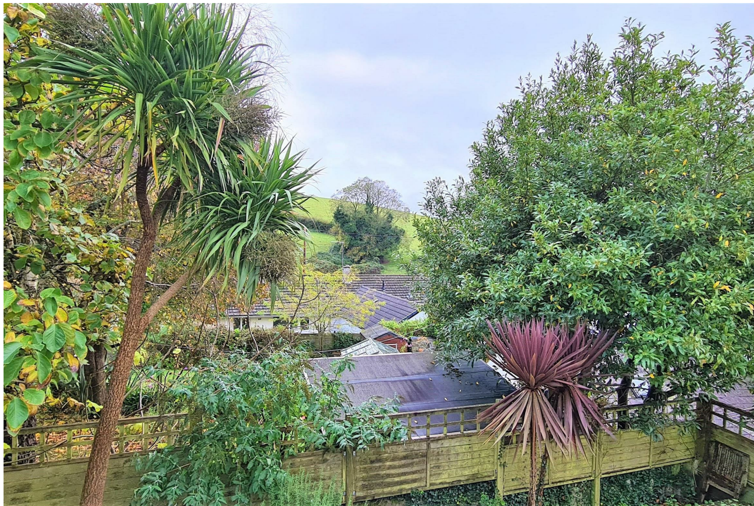
Cobble Barn Vicarage Lane, Tywardreath, Cornwall, PL24 2PF